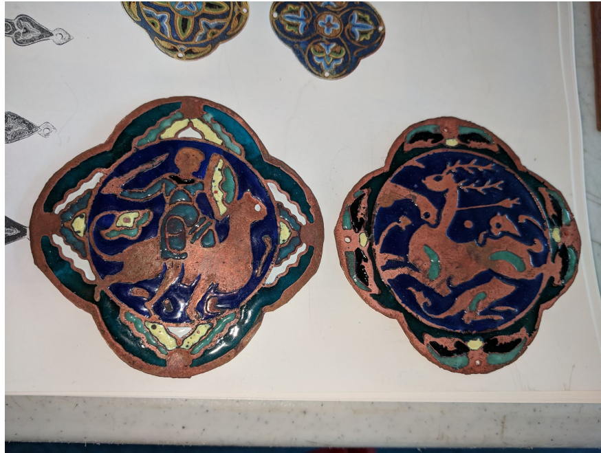
Figure 12: These medallions are medieval reproductions from the Enamels of Limoges Book. 2 See the next image for the book page. The medallion on the left has several flaws. The yellow enamel is finicky, the image is backward, and grid marks are present from where the heat transfer failed. The medallion on the right is in a similar state. Both need further processing