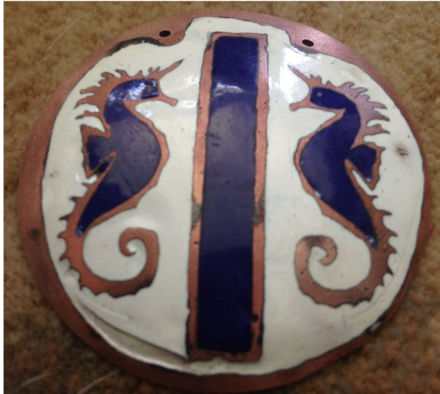
Figure 15: A crack in the enamel is visible on the bottom along with a low enamel spot on the right side. This is the result of several factors: etch too deep, inconsistent doming, and inconsistent resist applied