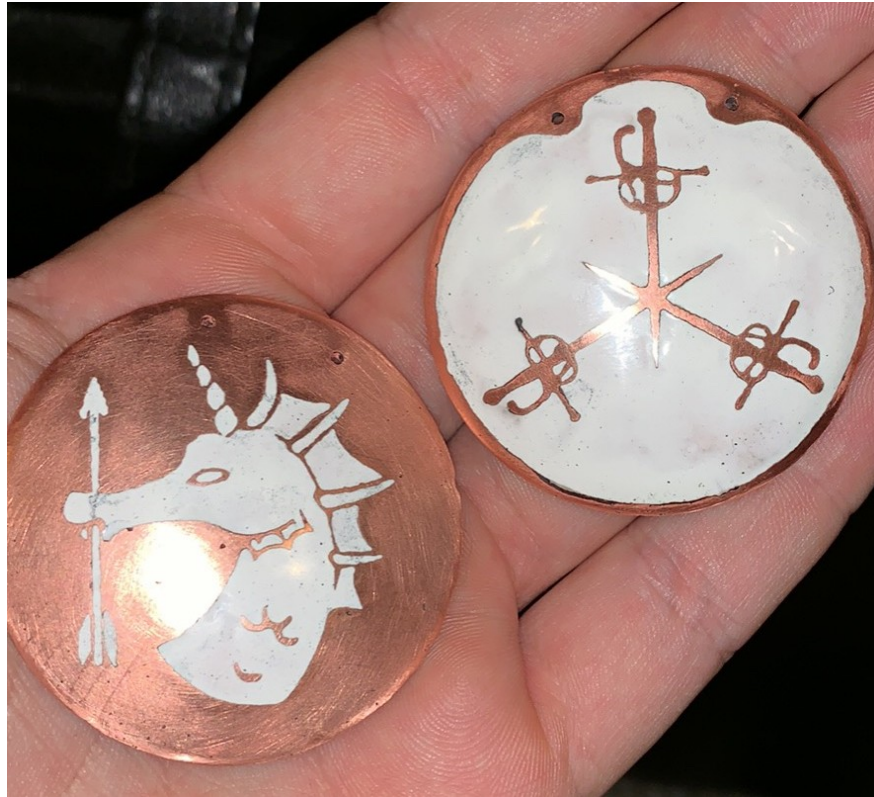
Figure 10: Yew Bow and MoD medallions after stoning and light sanding. Stoning grinds excess glass to reveal detail and level. Additionally, these two are good quality. The detail of the Yew Bow shows really nicely and its surface is smooth and shiny