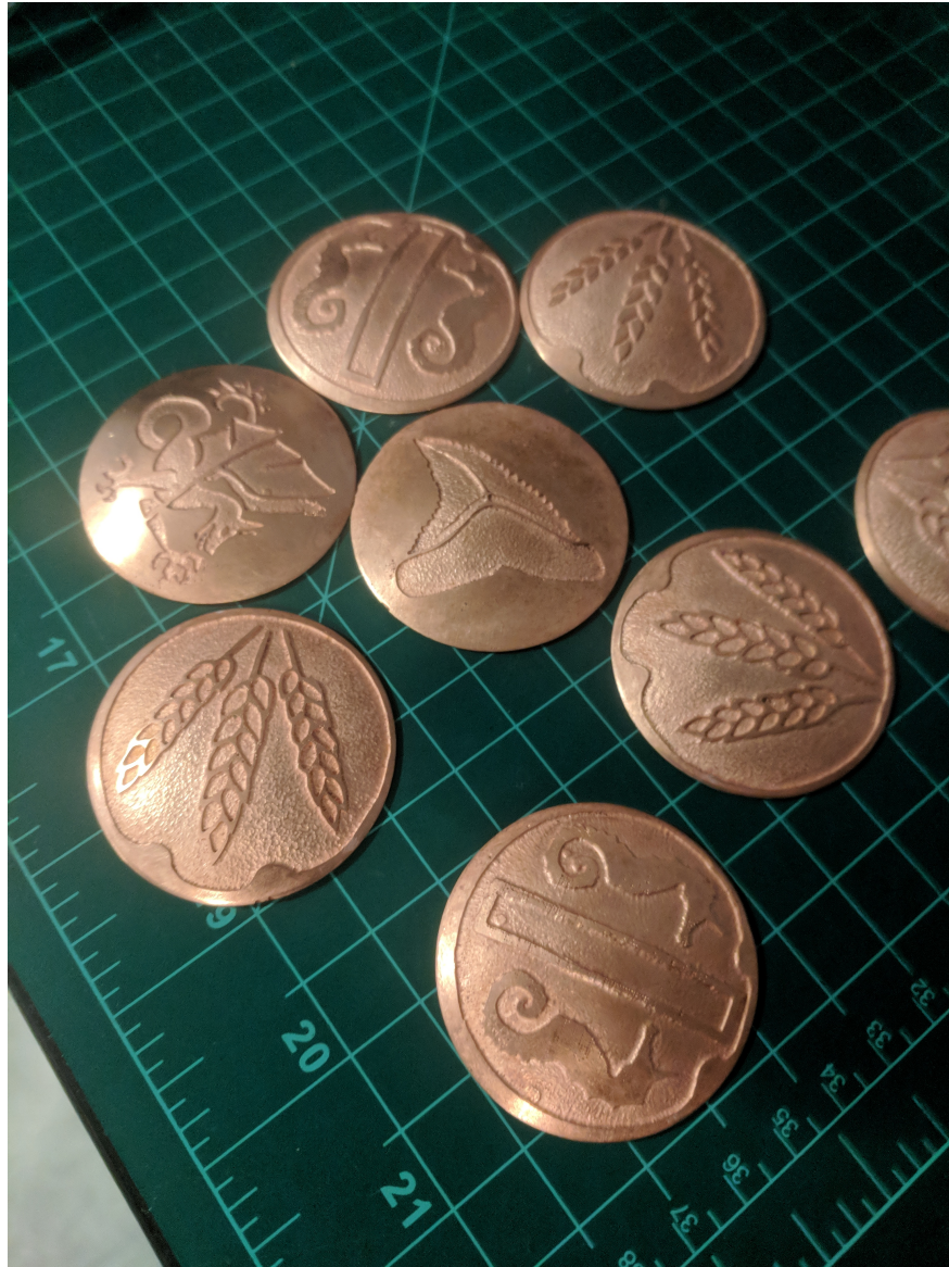
Figure 5: Etched copper cleaned and awaiting wet enamel packing