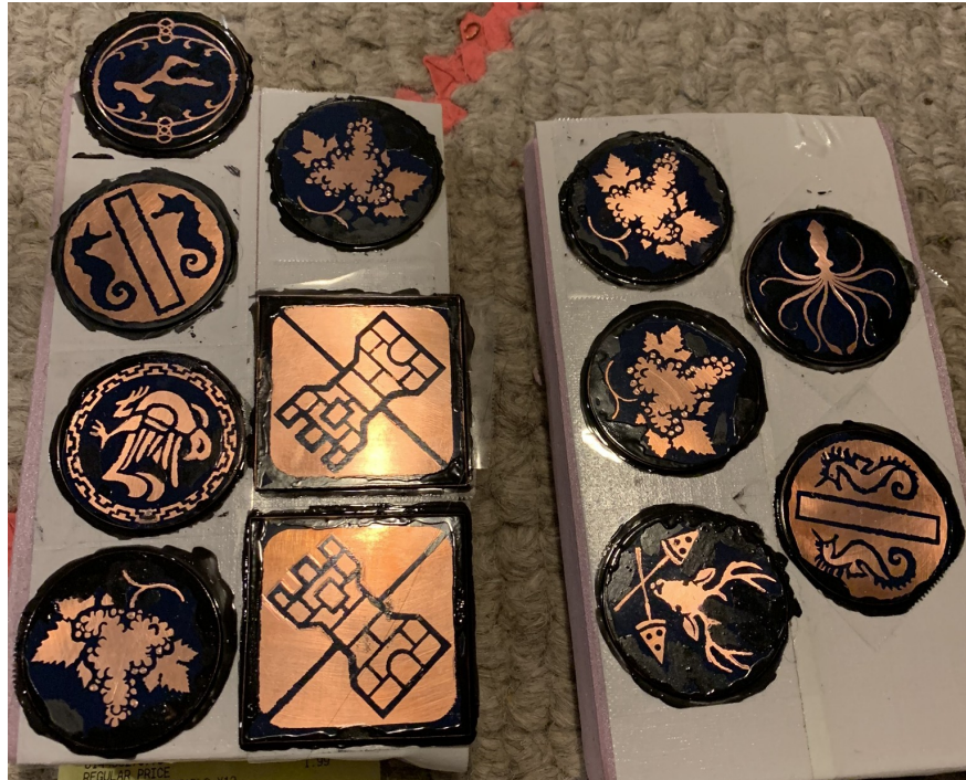
Figure 3: Resist Applied to copper with PnP Blue. Testor's paint was used to fill in the gaps and seal the metal to the foam block