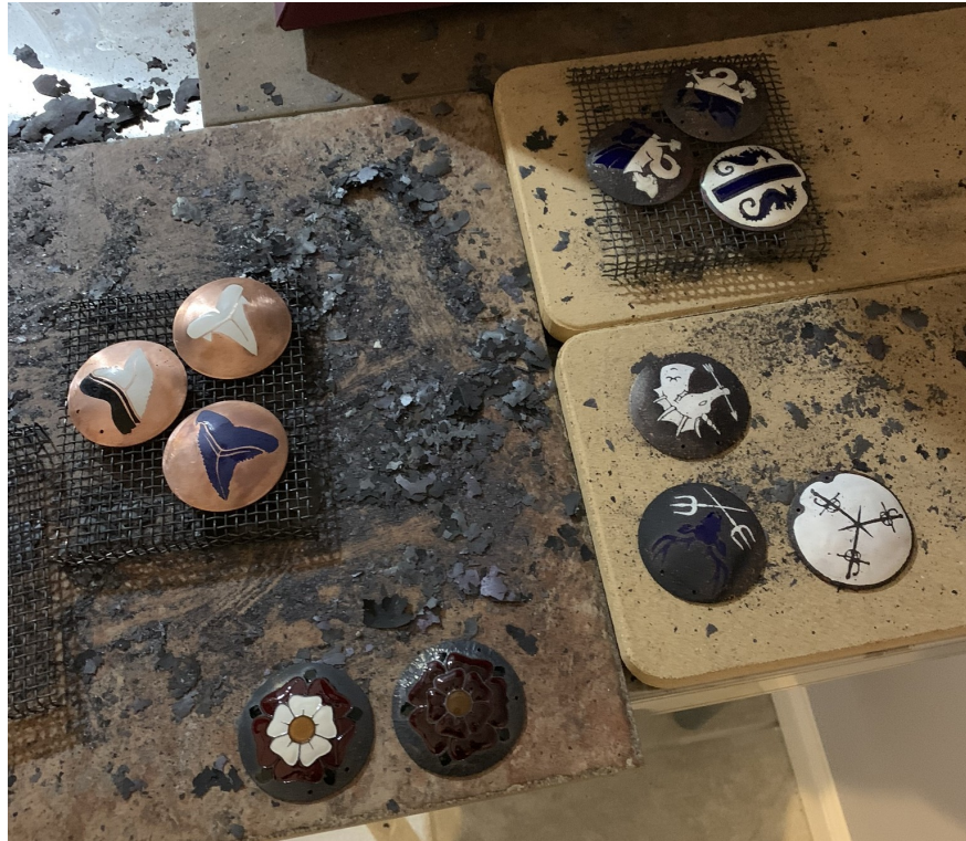
Figure 8: On the left, stoned and cleaned medallions ready for flash firing. On the right, medallions just out of the kiln. The fire scale is present and the enamel is slightly dark