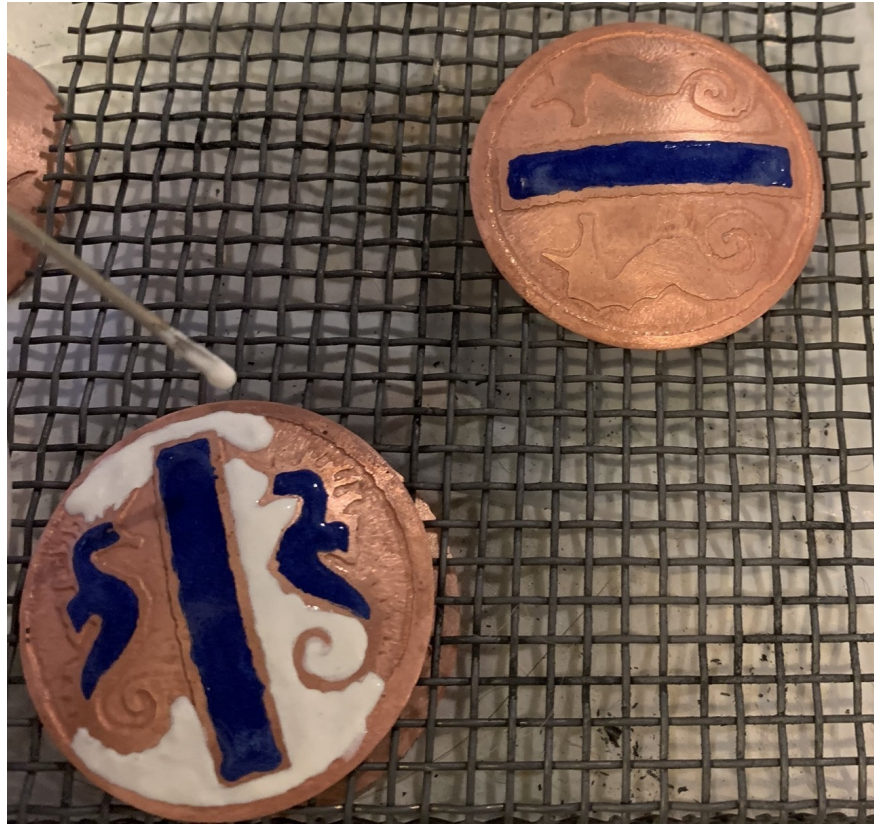
Figure 6: White Scarf medallions in the process of packing. Notice the enamel is wet, which aids in the process