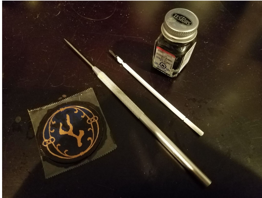
Figure 16: In addition to the PnP transfer paper, we use these tools to finish up the resist prior to etching. Testor's paint (any is fine, just not metallic!) is used to seal the metal and paint what the PnP missed. The paintbrush is used to application. The steel 'needle tool' is used for scratching away resist to provide enhances detail