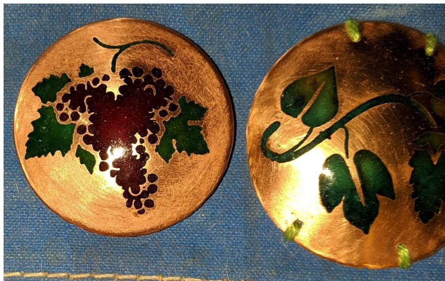
Figure 11: Tempranillo grape medallion and a hops medallion. These two are examples of good quality enameling. The surface is shiny and the glass and metal are smooth across the entire surface