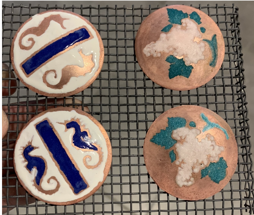
Figure 7: Two grape medallions on the right are dry and ready to be fired. If the enamel is too wet when it goes into the kiln the water vaporizes and interferes with enamel quality