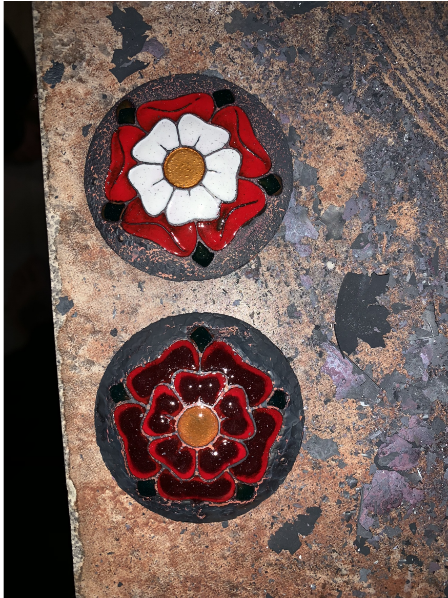
Figure 9: This red color just out of the kiln is black which can be seen in the previous image, but as it cools it goes back into this red. Notice how dark spots remain on the upper medallion - a sign that the red enamel is too thin