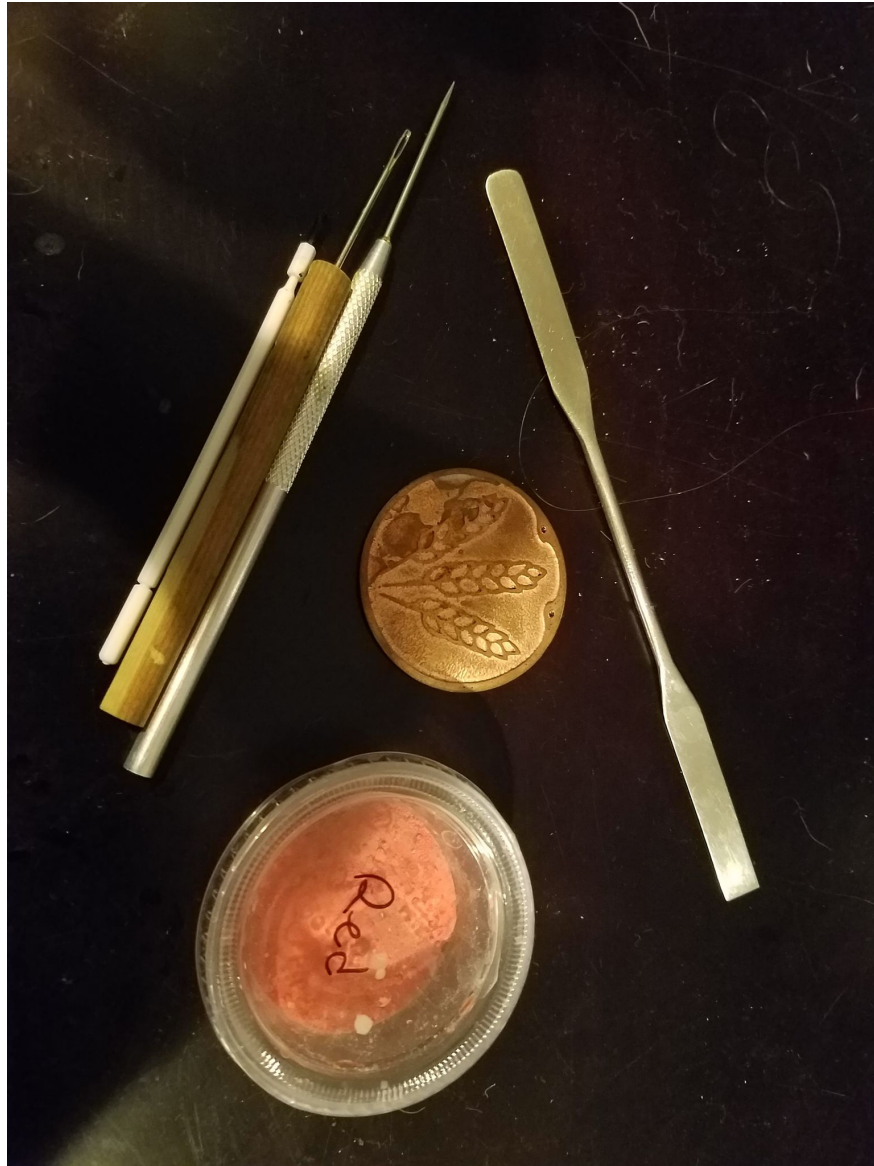
Figure 17: These are what are used to pack the enamel onto the metal surface. The red enamel here is placed into a 2 oz condiment container (this prevents the main stock from becoming contaminated). The steel paddle tool is used to transfer enamel to the container. The needle tool is used again here to apply enamel in detail to the surface. Next to it is a wooden dowel with a darning needle, also used to apply enamel. A small paintbrush is also used for the same purpose