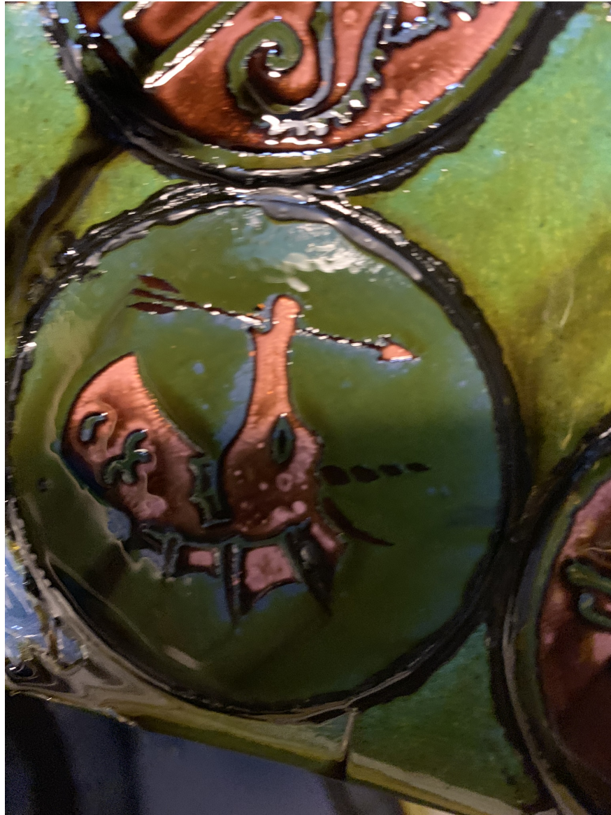
Figure 4: Yew Bow medallion in the etchant bath. Notice how the resist is preventing the rest of the metal from dissolving