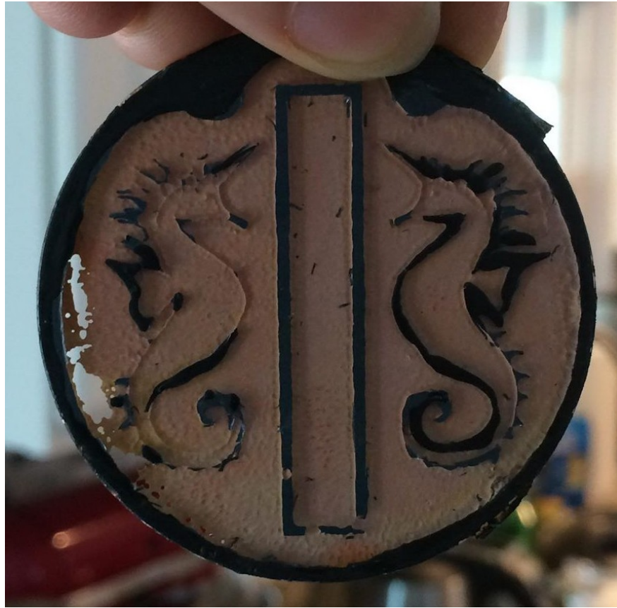
Figure 14: This White Scarf medallion was in the etchant bath for too long. Not good.