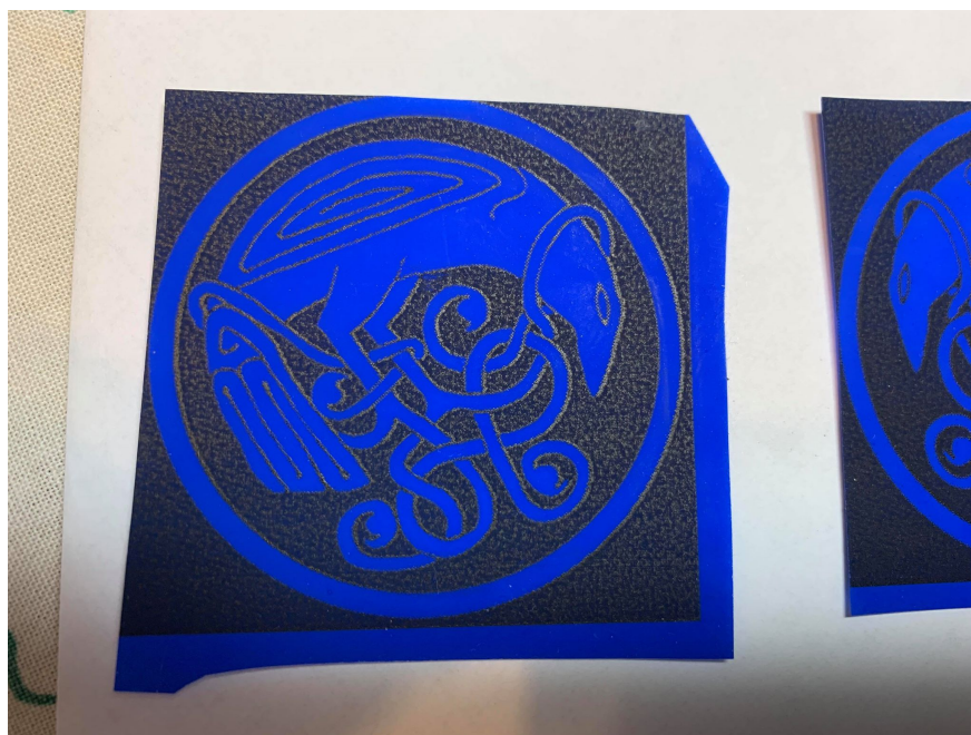
Figure 2: Example of drawing printed onto PnP (Art by Brose - this is her sheet). This must be printed with a laser printer. Inkjet will not work.